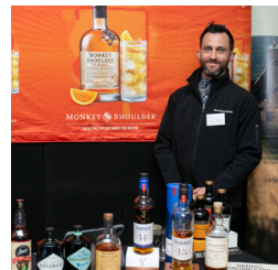
William Grant & Sons