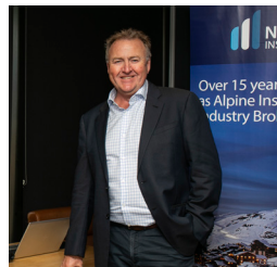
North East Insurance Brokers