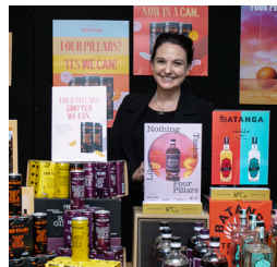
Vanguard Luxury Brands