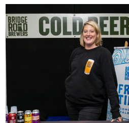
Bridge Road Brewers