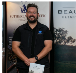
Oakdale Meat Co.