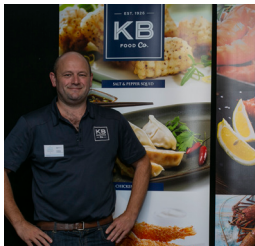
KB Seafood Co.