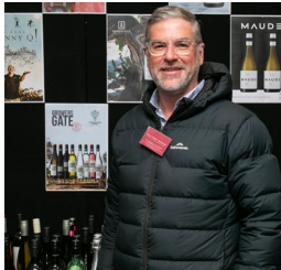
Domain Wine Shippers