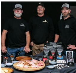
Tawonga South Butchery