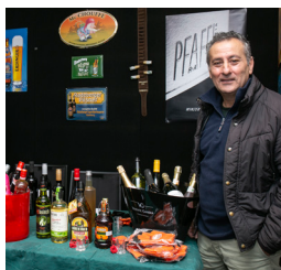
Beach Avenue Wholesalers